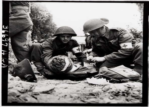
A casualty of the 3 rd Canadian Infantry Division receives first aid