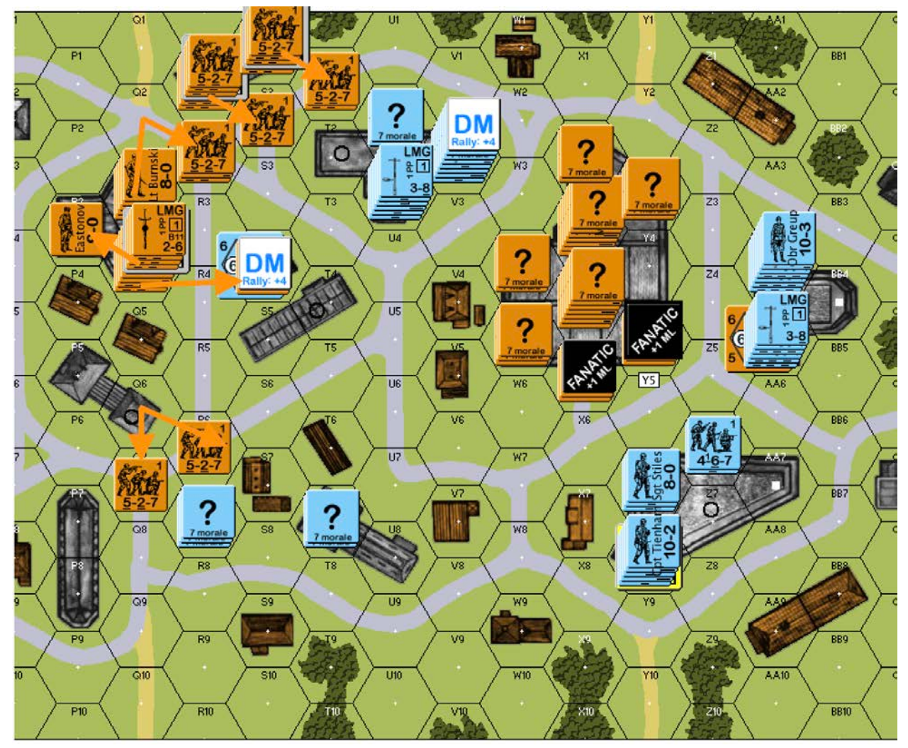
End of Russian Turn 1: Russians advance, exposing several "?" stacks and only losing 1 squad and breaking another in the process. German defensive fire is abysmal – they expose several "?" stacks, but lose both of their Flamethrowers and one 9-1 leader to Russian SNIPER.