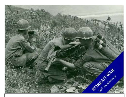
VC: To win the ROK must exit \geq 10 VP of infantry off the south edge of map 1.

Kaesong, South Korea, 25 June 1950. On 3 May 1949, the North Koreans launched their first open attack across the 38th Parallel in the vicinity of Kaesong, but ROK units repulsed them. Hundreds of small-scale assaults occurred across the parallel during the first half of 1950. The North Koreans concentrated half of their forces on the Uijongbu Corridor, an ancient invasion route that led directly south to Seoul. Kaesong, home of the ROK 12<sup>th</sup> Regiment was directly in their path. The circle in the center of Kaesong drew small arms immediately as half a mile away, at the railroad station which was in plain view; North Korean soldiers were unloading from a train of perhaps fifteen cars. Some of these soldiers were already advancing toward the center of town encircling forward battalions of the ROK 12<sup>th</sup> Regiment.