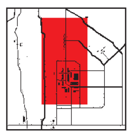
(Only hexrows N-DD and Hexes numbered \geq 4 and \leq 30 are in play)

Replace the 9-1 leader with a 9-2 leader